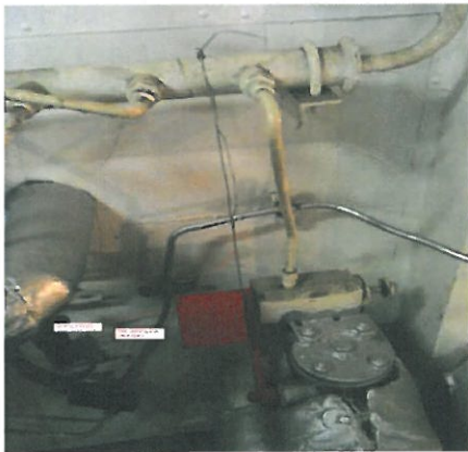
QCV blocked utilizing wire to hold closing weight up and the valve in the open position.